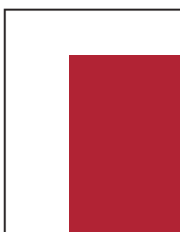
Jr. Full Page 6.5w x 8.75h