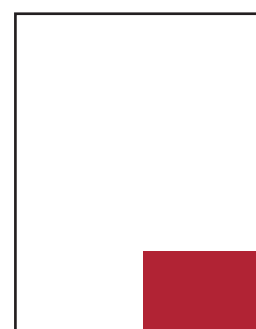
Eighth Page 4.9w x 2.475h